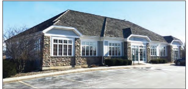
Design and Development / Corporate Headquarters North Barrington, IL 847.620.7990