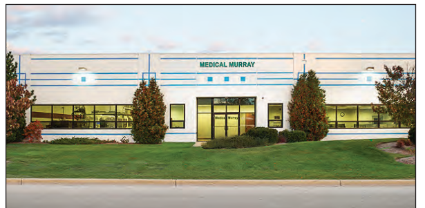
Contract Manufacturing Lake Zurich, IL 847.847.3700