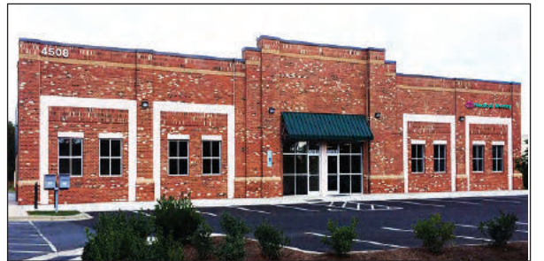
Design and Development / Contract Manufacturing Charlotte, NC 847.620.7990