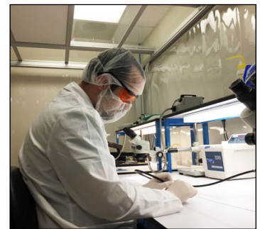
Our development process and its documentation comply with FDA 21 CFR Part 820 as implemented through our ISO 13485 certified Quality System.