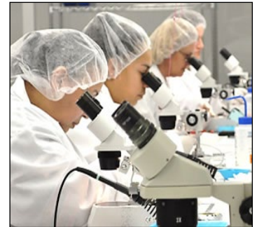
Medical Murray is FDA registered and can handle your full sterilization, packaging and distribution needs.