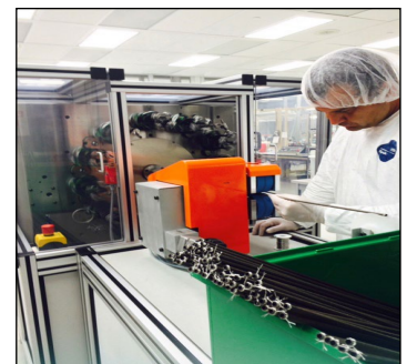
The manufacturing clean room is fully equipped with braiders and injection molding machines to packaging and custom forming equipment.